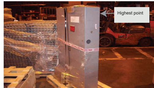
Apply actual dims to highest point of freight L x W x H.