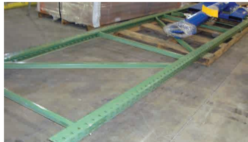
Actual shipment dimensions 104L x 42W x 43H, overlength rules to apply cube as: 104L x 48W x 48H (see rules).