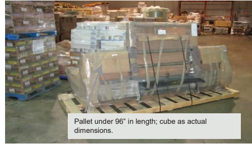
Cube as actual dimensions L X W X H