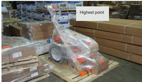
Apply actual dims to highest point of freight L x W x H