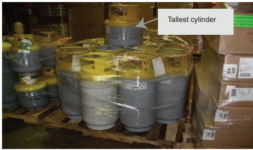
Apply actual dims (dimensional weight) to highest point of freight L x W x H (height of tallest cylinder)