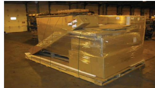
Actual dimension 100L x 68W x 52H, cube as: 100L x 96W x 96H