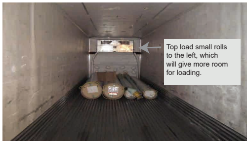
Actual dimensions are 12' feet long. Once small rolls are top loaded to the left, palletized freight can be loaded on right hand side. Cube as 144L x 48W x 96H.