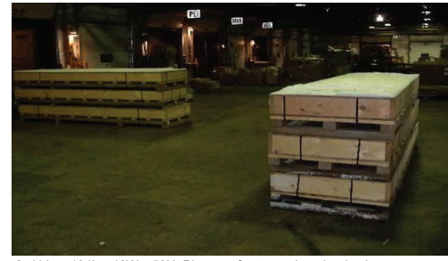
2 skids = 104L x 46W x 50H. Please refer to overlength rules in Reference Guide to determine exact cube.